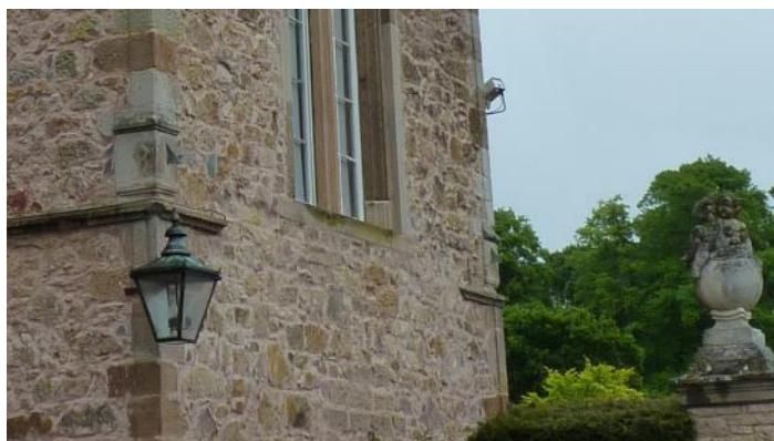
Fig. 9. The south-east and south-west dials together.

Finally, Fig. 9 shows the close proximity of these last two dials.