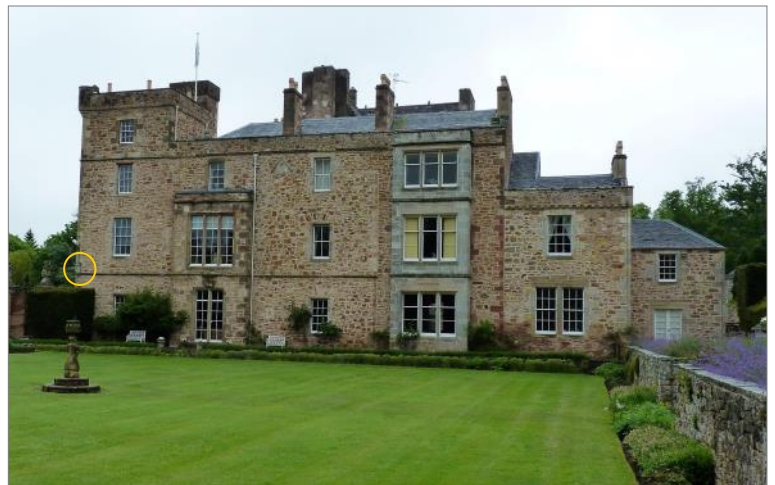
Fig. 6. Lennoxlove with the Lady in the left foreground and the south and east vertical dials (circled) above her and underneath the security camera.

This dial is on the left-hand edge of the building underneath the security camera and directly above the Lady in the left foreground of Fig. 6.