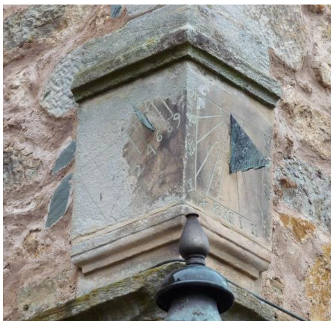
Fig. 8. Detail of the south and west vertical dials.

There is another dial at Lennoxlove which was not known to Ross. It is similar in design to the previous dial, but has south- and west-facing dials sitting as it does on the south-west corner of the house above the lamp (Fig. 7). Again like the south-east dial, the south face has Roman numerals whilst the west face has Arabic numerals (Fig. 8).