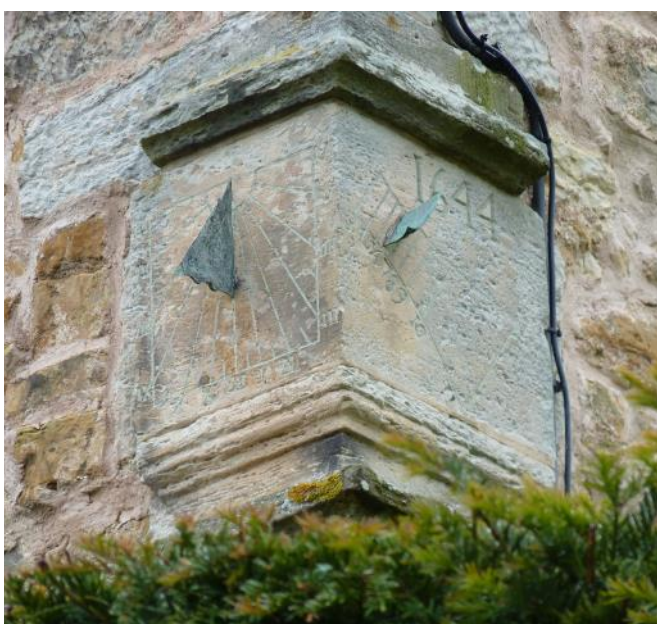
Fig. 5. The south and east vertical dials today with the probably re-engraved date.