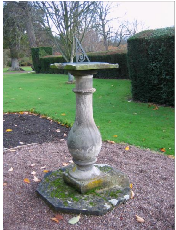
Fig. 2. The horizontal dial and pedestal.

As can be read above, Ross identifies it as a “round horizontal dial” but as can be seen from Fig. 3, it is clearly octagonal. It is almost certainly the same dial, however, as although the markings are only just legible today, the