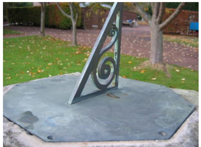
Fig. 3. Detail of the horizontal dial.

engraving described by Ross can be seen. There are Roman numerals from 4 am to 8 pm read from the inside on an inner ring. Outside that another ring includes hour, half- and quarter-hour lines, outside of which is a minute scale with ten minute intervals named. Additionally, “for latitude 56 degrees” can be identified on the dial, which is correct