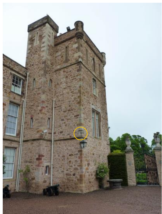
Fig. 7. The south and west vertical dials (circled) above the lamp on the corner of the house.