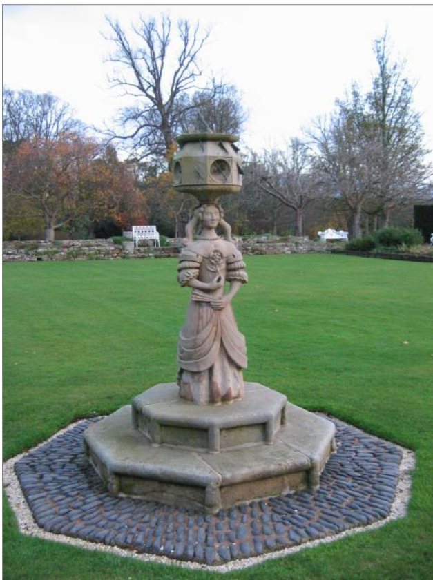
Fig. 1. The Lady of Lennoxlove.