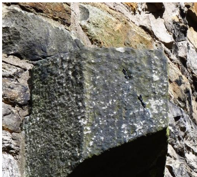
Fig. 10. Easter Coates sundial's west declining face.