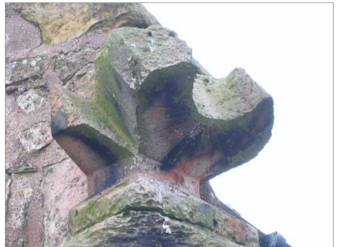
Fig. 4. The sundial at Cockburnspath.

The dial does bear some resemblance to a type of which there are only four known examples, 5 three of which are on churches (Figs 4, 5 and 6) with another at Seton Palace in East Lothian (Fig. 7). The significant difference is the lack of a semi-cylinder on the Easter Coates example although there are other differences. The main similarity, other than the general shape of the stone block, is the proclining face on each of the dials.