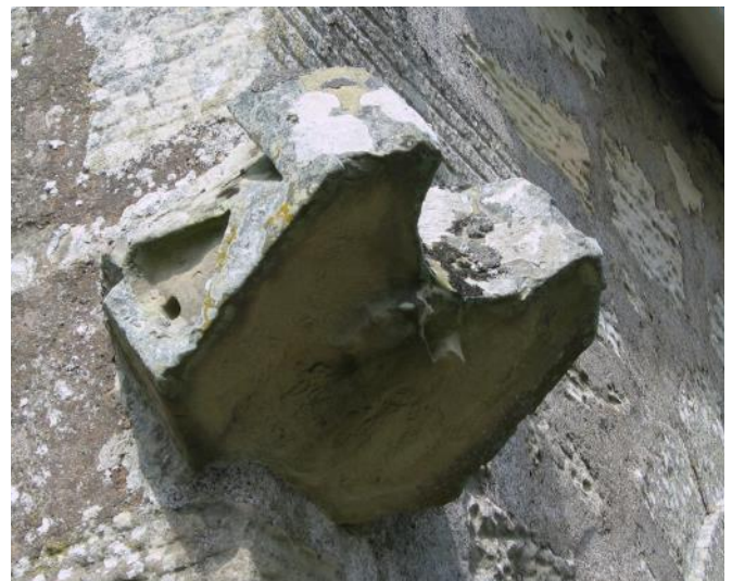
Fig. 5. The sundial at Fogo.