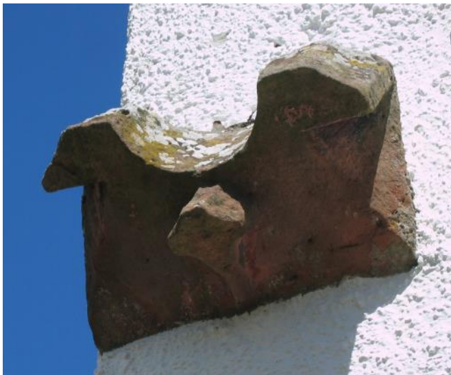
Fig. 6. The sundial at Oldhamstocks.