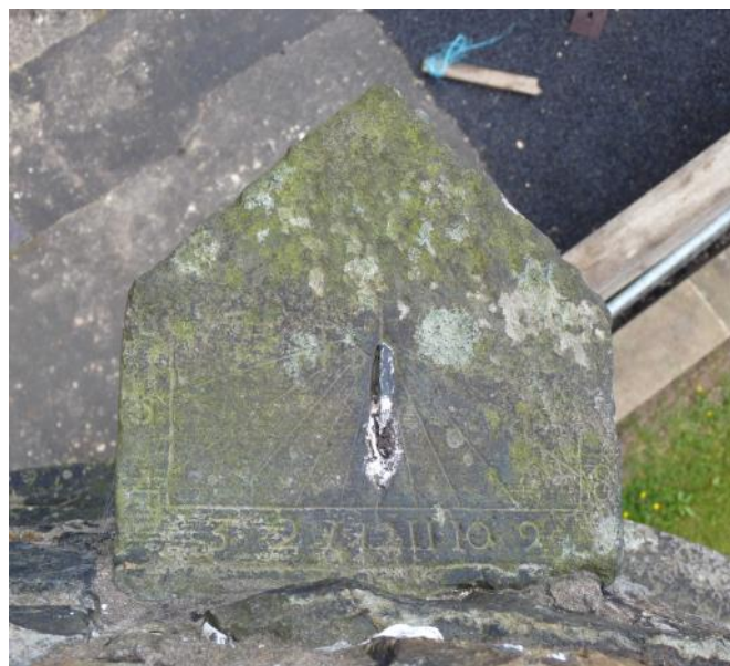
Fig. 12. The upper horizontal dial face at Easter Coates viewed from the small window above.

At last we gained access, but the window was jammed. Undaunted, my new friend Paul pulled a screwdriver from his pocket and soon the window was open. There was a sundial (Fig. 12) on the upper surface!