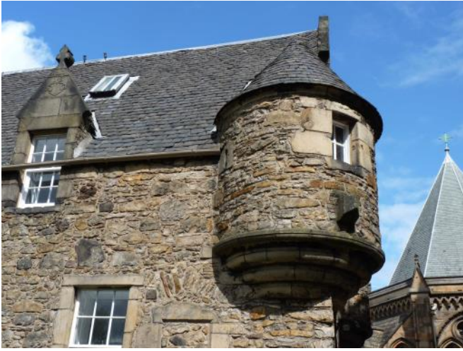
Fig. 3. The Easter Coates sundial on the south west angle of the building.