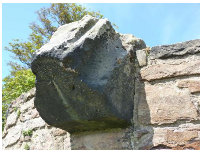
Fig. 7. The sundial at Seton Palace.