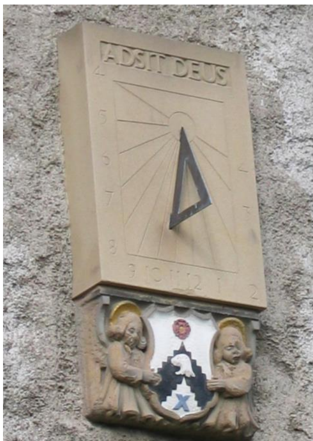
Fig. 11. The sundial at Pilrig House carved by the Easter Coates janitor in the 1980s.

When we arrived at the turret room, it was full of the nursery's soft play equipment which we started to remove. Immediately one of the young children asked why we were getting the soft play stuff out, as it wasn't time for it yet!