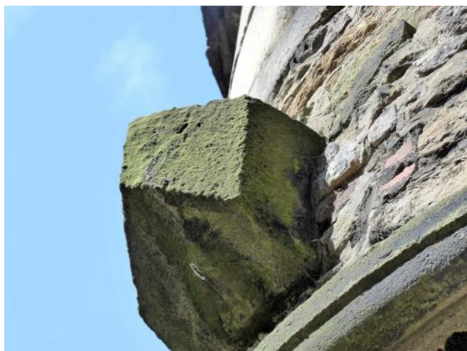
Fig. 8. Easter Coates sundial's proclining face.

The Easter Coates dial's proclining face is south facing and several Arabic numerals and hour lines can still be seen as well as the remains of the gnomon (Fig. 8). It also has east- and west-declining dials with only the east-declining dial having any remaining Arabic numerals (Figs 9 and 10), but both dials have gnomon holes. There is no evidence that