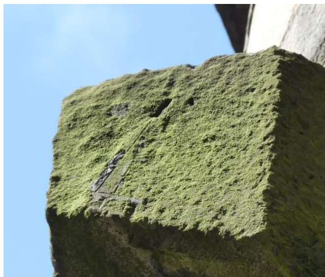
Fig. 9. Easter Coates sundial's east declining face.

As can be noted from the description of Easter Coates House, many carved stones from the demolished houses in Edinburgh's Old Town were preserved at Easter Coates, although mostly at the north wing. Of course if the sundial was one of them, it wouldn't have been sited to the north at Easter Coates but would have been placed logically in its current position. It could possibly have been relocated from an Old Town church, or could it have come from the French Ambassador's chapel mentioned by Ross? However, that doesn't necessarily change its likely date which I am still inclined to think is early 17th century.